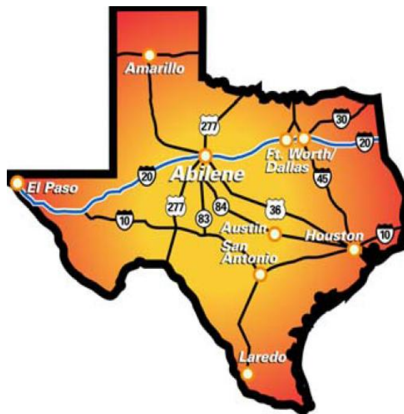
Figure 1: Abilene's Location

Texas generally and Abilene specifically are favorable for wind industry expansion for five reasons.